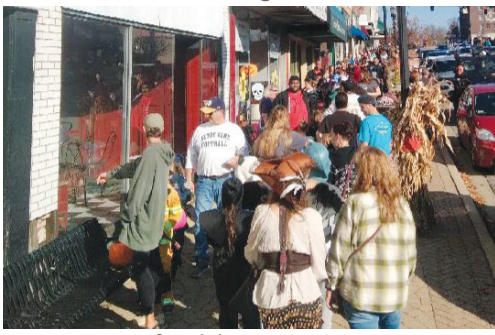
owntown Safe Trick or Treat