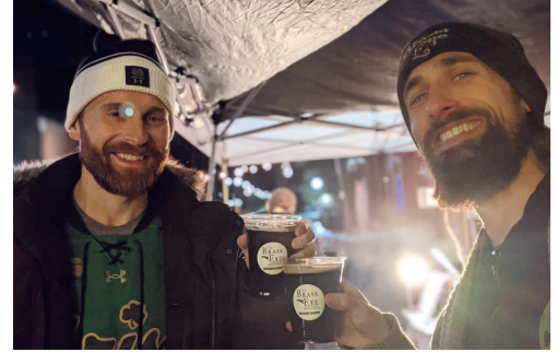
Volunteers at Small Business Saturday

"Main Street, now more than ever, is where our community thrives. It's where we come together, celebrate, and support each other. It's where we work, shop, and dine. The Niles Main Street program exists to make sure we continue to thrive."