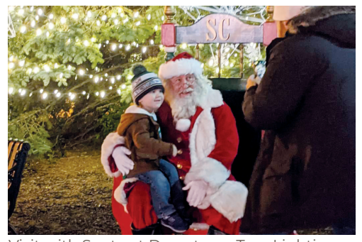
Visit with Santa at Downtown Tree Lighting